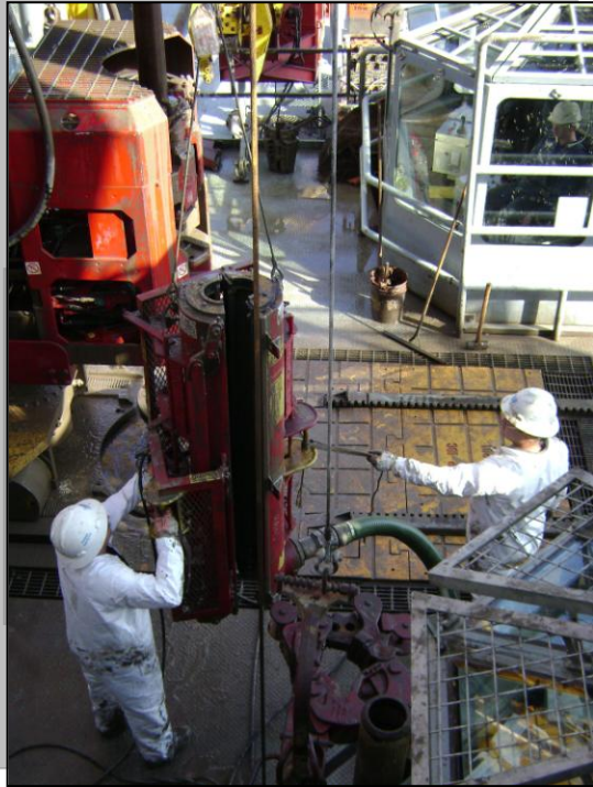
Geologists believe the North Aleutian Basin is predominantly gas-prone.

groups, other organizations and individual residents submit their letters/resolutions of support. The federal government will not allow the 2010 – 2015 OCS Oil and Gas Leasing Program for the North Aleutian Basin to go forward without a tremendous show of support. The